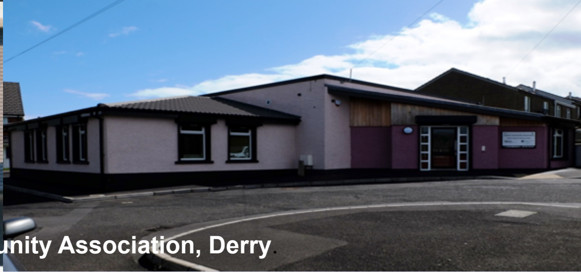
Skeoge House, leafair Community Association, Derry