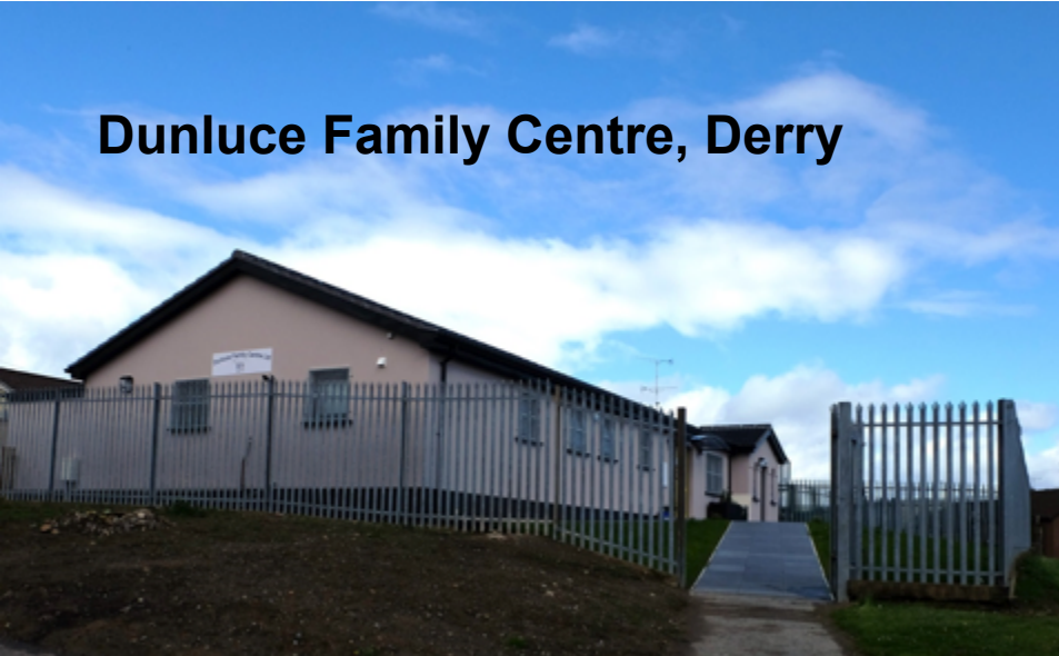
Dunluce Family Centre, Derry