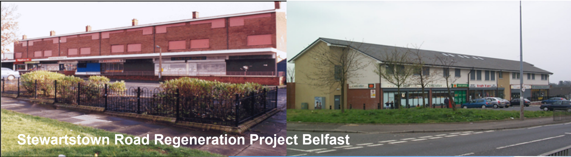
Stewartstown Road Regeneration Project Belfast